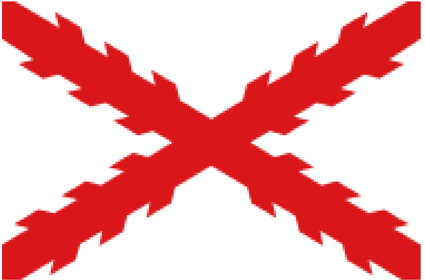
FLAG OF THE CROSS OF BURGUNDY