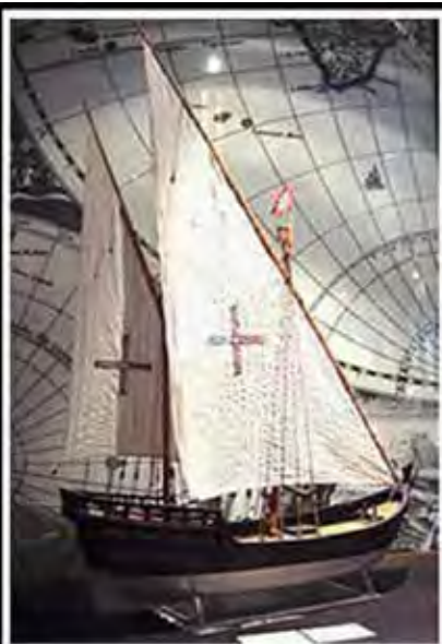
Portuguese caravel. The caravel was developed by the Portuguese for use in the 15th Century. This was the standard model used by the Portuguese in their voyages of exploration. It was able to sail into the wind, unlike every other ship.

The 1443, Royal Decree had granted Prince Henry of Portugal the sole right to send vessels south of Cape Bojador, as well, he was to receive one-fifth of all the profits from the area. Henry became