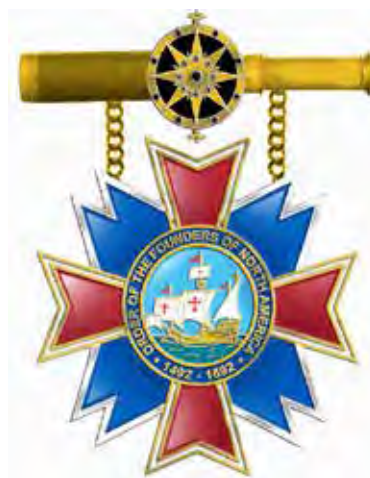
As shown on front of magazine

A production run of the medals was made available at the Annual Meeting of the OFNA. Members received an e-mail update when the medals become available. At that time an order form was distributed by e-mail and placed on the website.