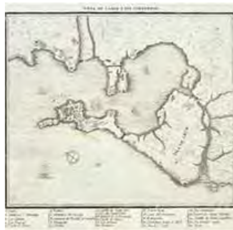
Insulae Capitis Viridis (1598) by Barent Langenes, from the Bibliothèque National, Paris.

Cadiz is thought to be the oldest city in Europe, founded by the Phoenicians in 1100BC. Like Lisbon, Cadiz was a port used by the Phoenicians and Greeks, later the Romans, Visigoths, and others.